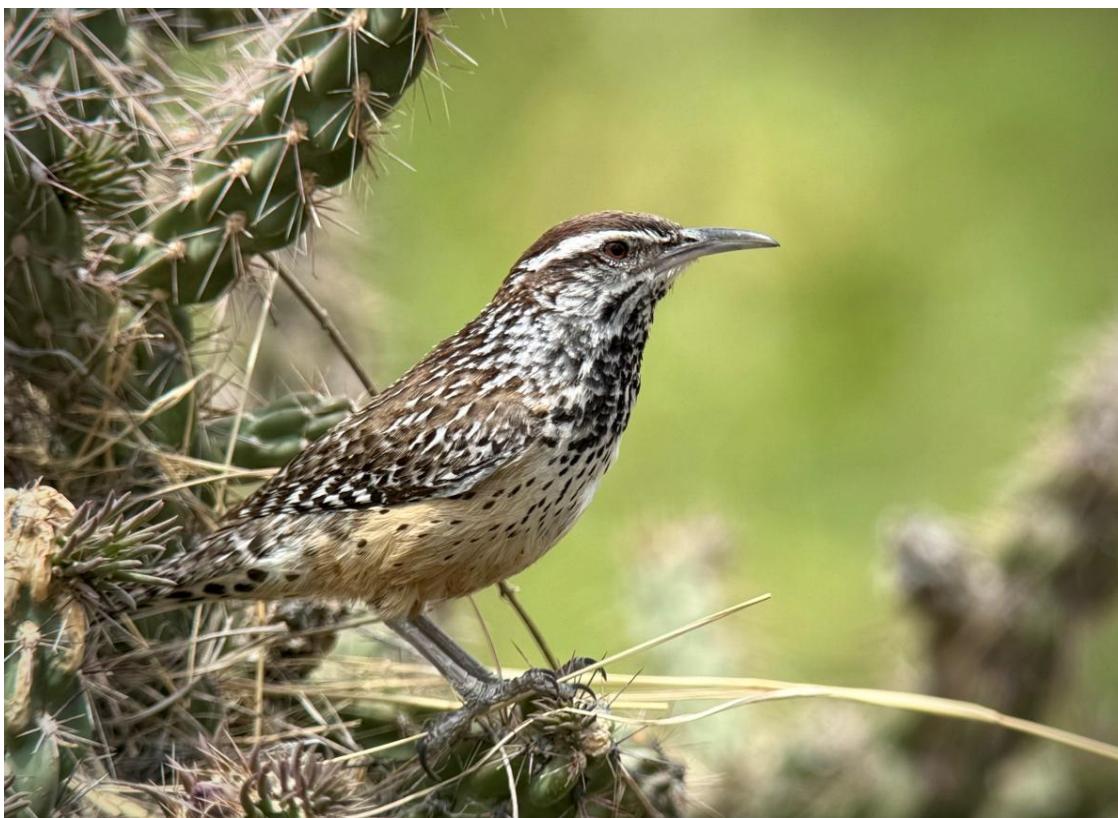
Cactus Wren

Cottonwoods and willows surrounding the nearby springs may harbor Golden-fronted Woodpecker, Phainopepla, Bells' Vireo, Blue Grosbeak, Painted and Varied buntings, and Orchard Oriole. We will have two full days to leisurely bird the ranch property itself.