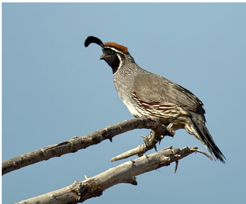
Gambel's Quail at Rio Bosque Park

April 25, Day 2: El Paso to Fort Davis. We will likely start out this morning at Rio Bosque Park located along the Rio Grande in southeast El Paso. This can be a very good spot for finding a variety of passerine migrants (flycatchers, vireos, warblers and sparrows), in addition to such resident species as Gambel's Quail, Harris's Hawk and Crissal Thrasher among others. Later, we will work our way southeast along the river valley making brief stops at nearby irrigation impoundments which should yield a variety of waterbirds. Both Western and Clark's grebes are to be expected, and numerous ducks, shorebirds, and terns are possible. The drive through the agricultural lands will provide more opportunities for locating a Crissal Thrasher. Other species to look for include Swainson's Hawk, Greater Roadrunner, Western Kingbird, Cave Swallow and Blue Grosbeak. By mid to late morning, we will head eastward toward Van Horn, where we will stop for lunch.