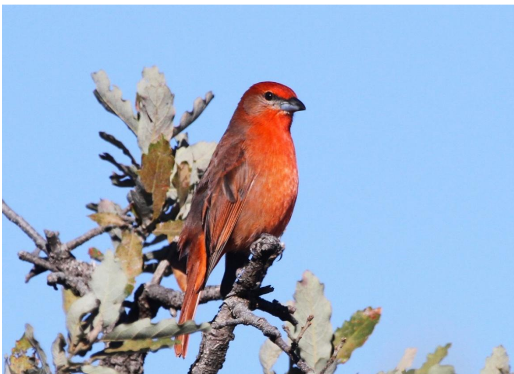
Hepatic Tanager

By any measure, the Davis Mountains are a special place, a very different part of Texas that features unique landscapes and an ambience of its own. We will have most of two days to explore this wonderful area. On this day we will focus on the Nature Conservancy's Davis Mountains Preserve, while part of the following day will be dedicated to time in Davis Mountains State Park.