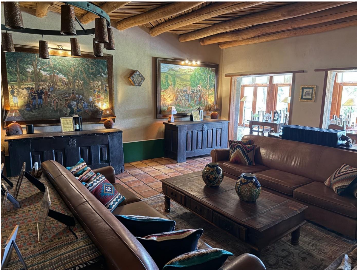
The beautiful Mexican and ranch-style Decor at Cibolo Creek Ranch

Cibolo Creek Ranch is the paragon of a ranch-style retreat. Offering luxurious accommodations, marvelous cuisine, and access to an abundance of birds and outstanding scenery. The ranch surely ranks among Texas' finest getaway destinations. Every guest room is designed to capture the style and spirit of the dramatic history of the ranch. Each room has been individually designed and uniquely furnished according to traditional Mexican architectural style and includes spacious verandas and Saltillo tile floors, Mexican and Spanish antiques, down comforters, hand-stitched quilts, painted tin retablos, vintage lamps, bath amenities, and adobe fireplaces. The ranch grounds meanwhile are a tantalizing draw, particularly for morning and afternoon birding excursions.